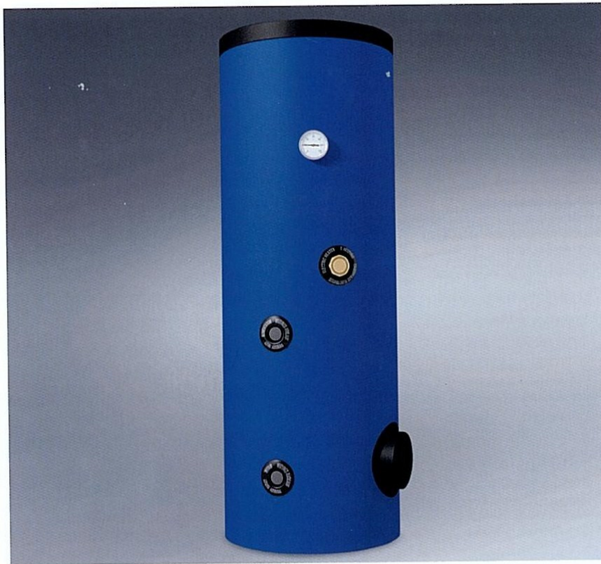
Schüco Solar Storage Tank

The Schüco Solar Tank HE-2 is a well-crafted, extremely durable solar storage tanks that come in 80 and 105 gallon sizes.